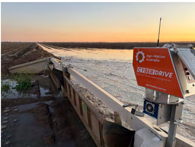
Figure 11: Tail drain backing up tailwater before detachable controller opens based on time or water sensor.