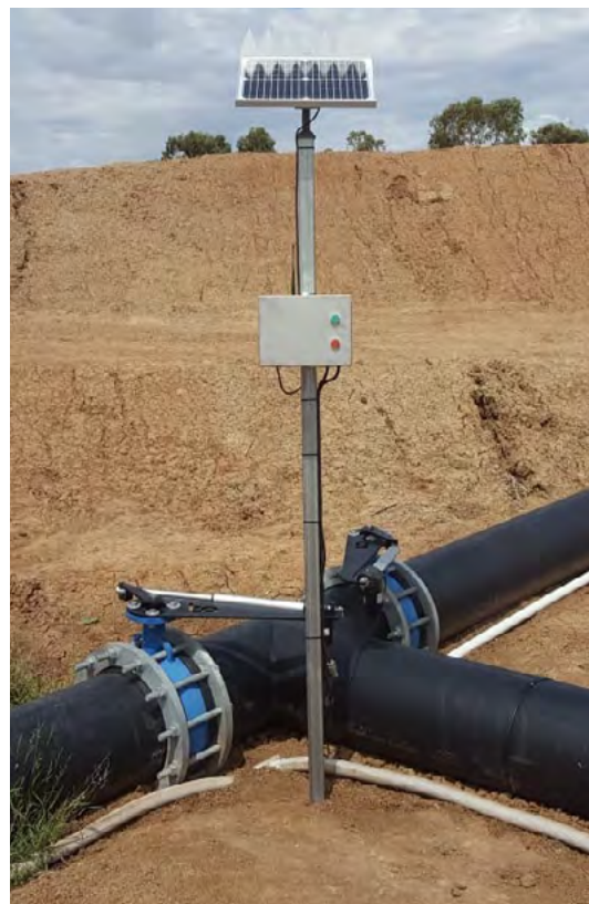
Figure 12: RIGHT: Pipe controller enables remote and automated control with manual over-ride buttons in event of communication failure.