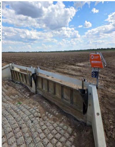
Figure 6: RIGHT: Automated winch driven controller. ABOVE: Direct drive removable controller.