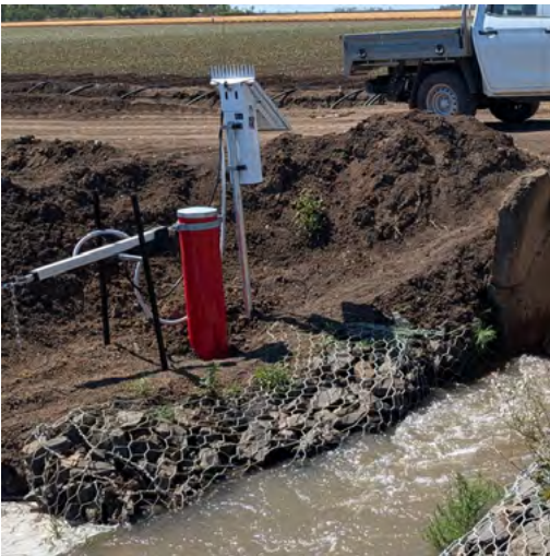
Figure 5: Irrigation controllers such as this one can be used for many applications - driving motors, actuators, relays, valves, gates, pumps, doors and more.