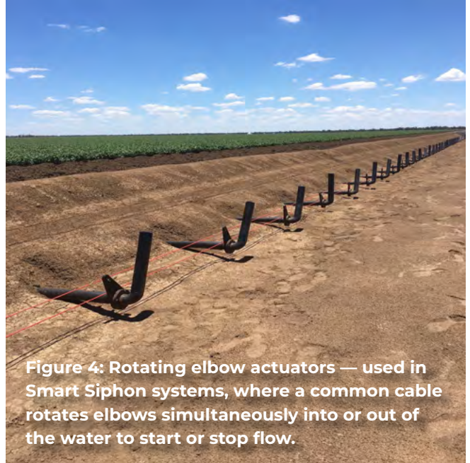
Figure 4: Rotating elbow actuators — used in Smart Siphon systems, where a common cable rotates elbows simultaneously into or out of the water to start or stop flow.