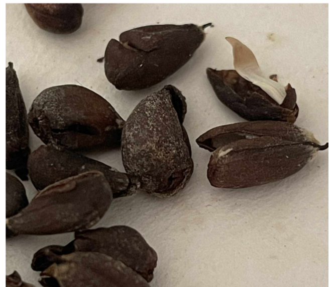
Major damage: seeds with large cuts or cracks, or part of the seed coat missing.