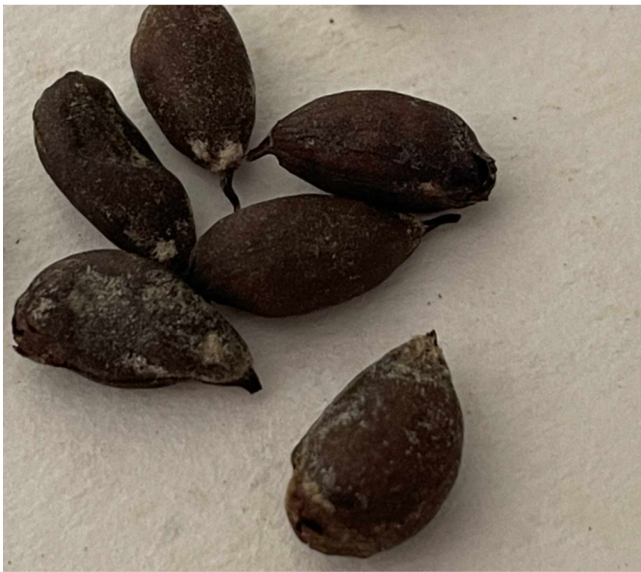
Pinhole damage: seeds with only one or two small (pinhole) punctures in seed coats.