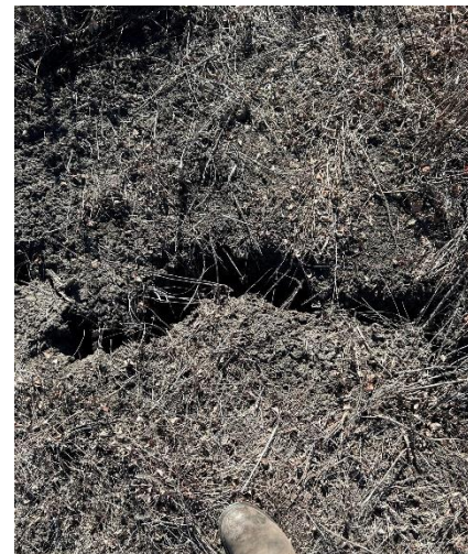
Figure 1 Soil Cracking in MacIntyre

The MacIntyre region outlook is more positive with Glenlyon Dam at 97.5% and Pindari at 83.7%. Estimates are for around 35,000ha of plantings at this stage plus some dryland although the latter would be getting dubious at this stage.